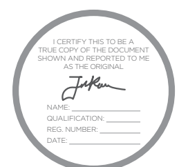
PHOTOCOPY OF ID WITH CERTIFICATION